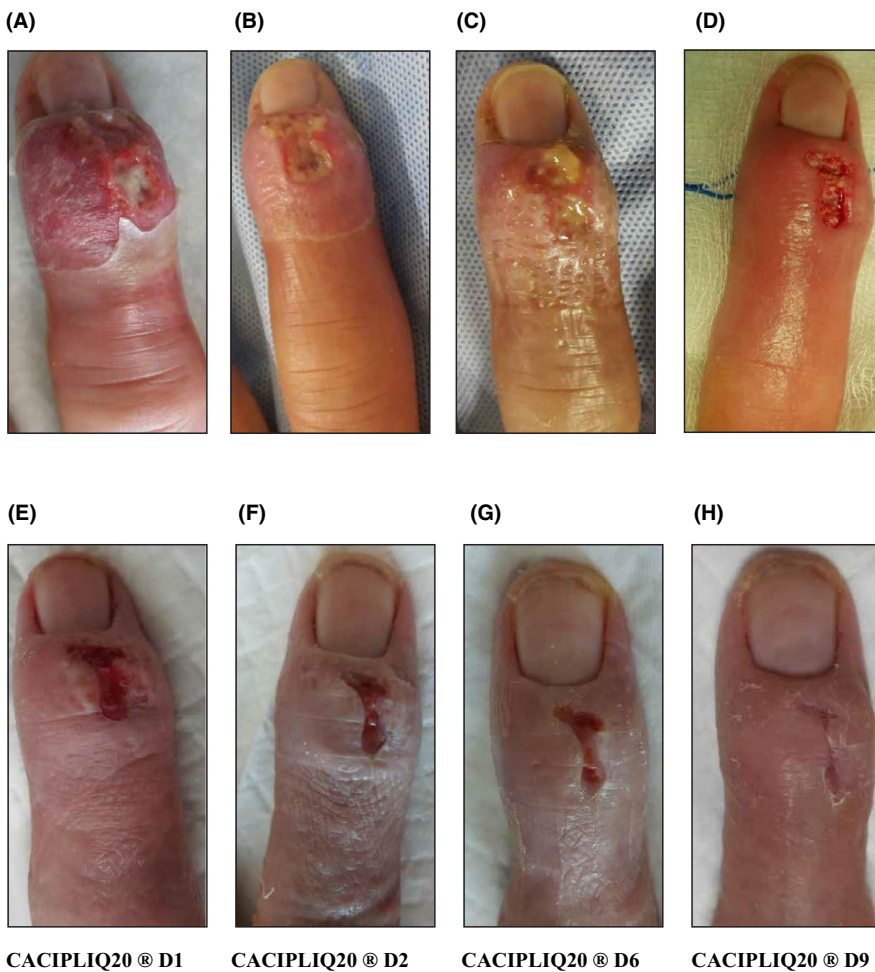
FIGURE 2 A, Highly erythematous digit with inflammation extending proximally. B, After 2 days of antibiotics, the inflammation and erythema reduced but the wound was still dirty. C, Another 2 days later, the wound was not improving. D, He was taken to theater and debrided thoroughly. E, Two days after debridement, the results were not as promising and CACIPLIQ20® was started. F, An immediate reduction in the width of the wound was noted and followed by the depth—bridging granulation seen (G). H, Final appearance showing the returning shape of the finger